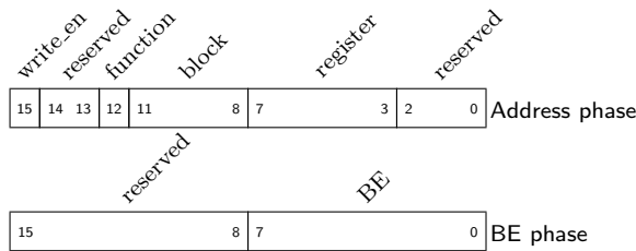
Figure 1: Address and BE phases for register access