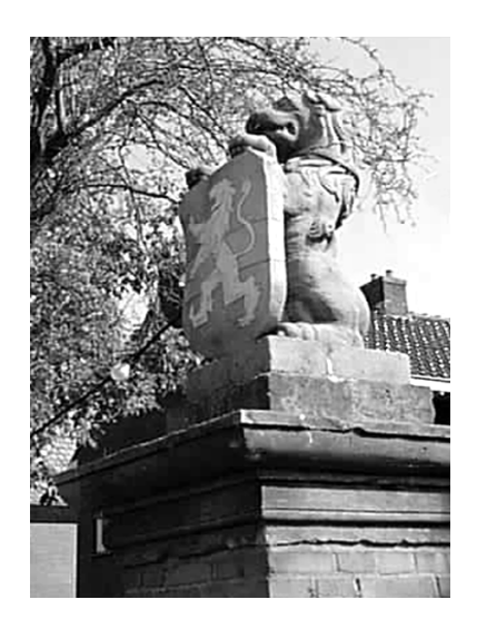
Figure 36.1 The Dutch lion is a sentry.

The value in the first set of square brackets, [3] indicates that you want to use three variables #1, #2 and #3. In the command call \myputfigure you have to input these variables between curly braces. The result is shown in fig 36.1.