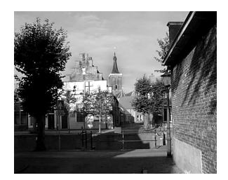
Figure 33.2 A stepgable.

The other distances and measures are shown in table ??.