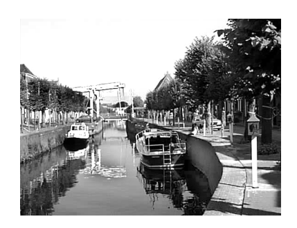
Figure 25.1 A characteristic picture of Hasselt.

There are many canals in Hasselt (see figure 25.1). . . . Boats can be moored in the canals of Hasselt (see figure 25.1).