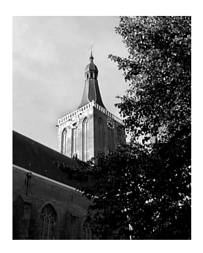
Figure 10.1 Stephanus Church.

After processing this will come out as figure 10.1 at the first available place.