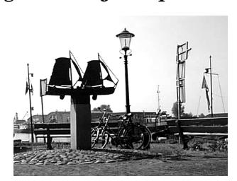
Figure 10.4 Just a picture.

may contain equations or several rows of text. Horizontal and vertical lines may be drawn wholly or partially across the table.